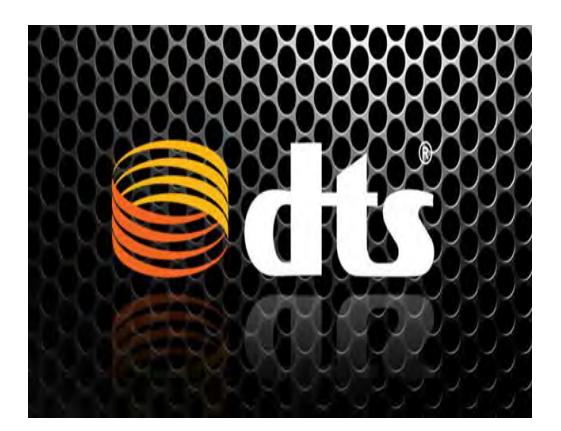
DTS - Develops Hi-Def audio and processing technologies

Premier audio solutions provider for high-definition entertainment experiences—anytime, anywhere, on any device. DTS' audio solutions enable delivery and playback of clear, compelling high-definition. From a renowned legacy as a pioneer in high definition multi-channel audio, DTS became a mandatory audio format in the Blu-ray Disc standard.